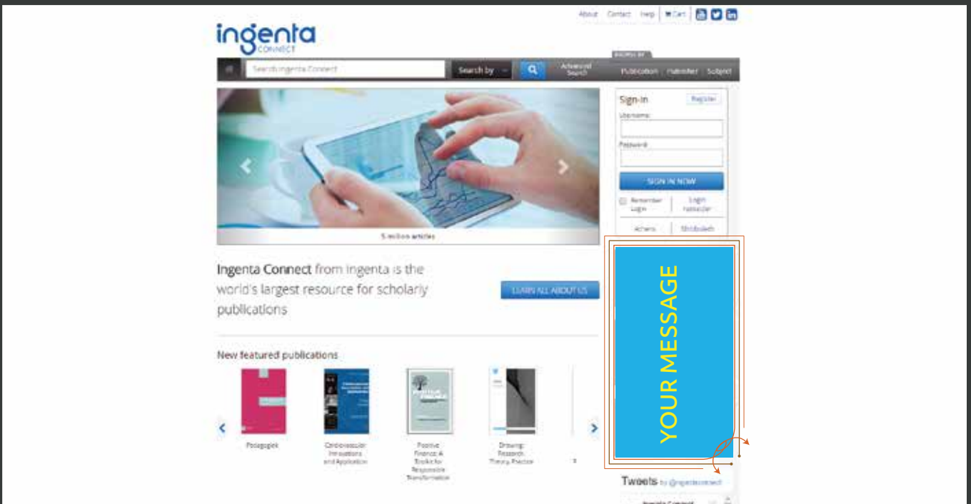
www.ingentaconnect.com 160 x 600px carousel ad with a max of four ads on rotation, £250 per month