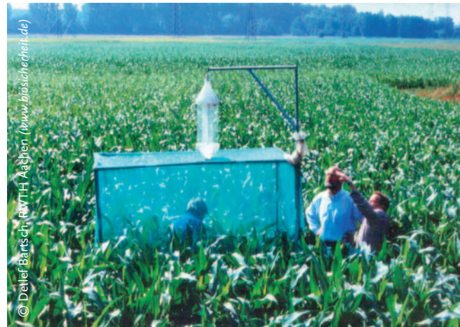
... while ecologists expect the unexpected.

In ecology, non-knowledge is seen as the result of the contingent experimental research strategy and the problematic (re-)transfer of experimental results to open, complex, and dynamic natural systems. This attitude is underlined by recurrent failures in forecasting the behaviour of natural entities. Particularly in ecosystem ecology, major epistemic strategies appear to consist of maintain-