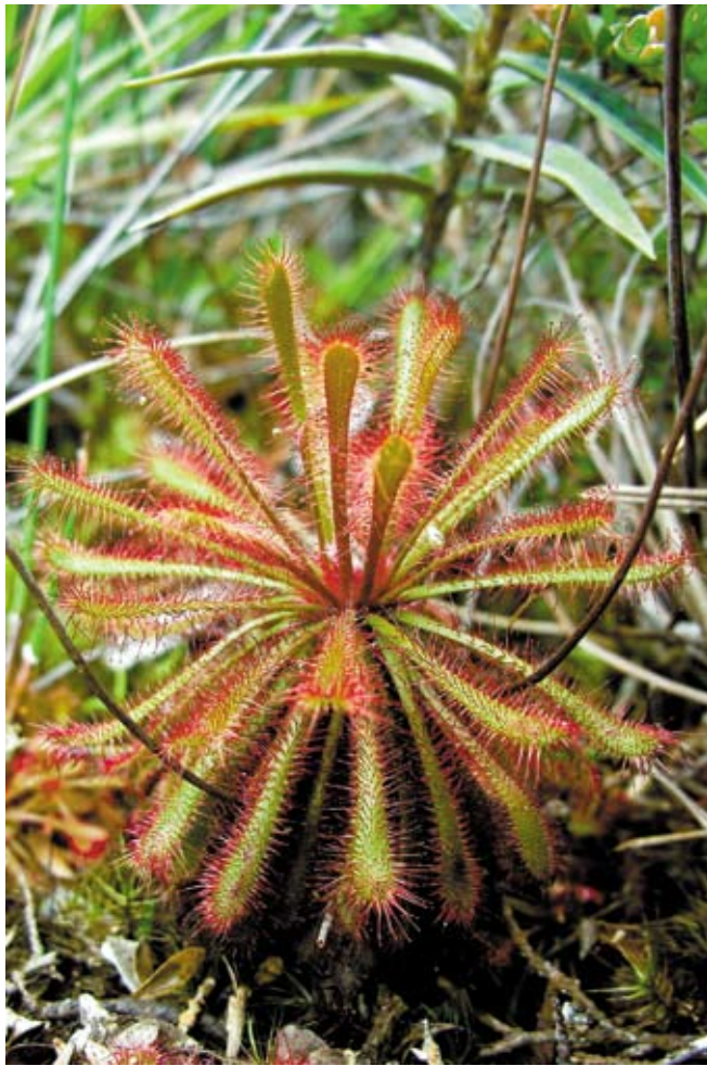
Fig. 1 Drosera ultramafica on Mt Mantalingahan, Palawan.

3000 m (W.J.J.O. de Wilde & B.E.E. de Wilde-Duyfjes 16360) have scapes only 1 cm in length and rosettes \pm 1.5 cm diam. Plants of D. ultramafica from Aceh are often associated with the locally endemic carnivorous plant Utricularia steenisii P.Taylor (e.g. intermixed in collection W.J.J.O. de Wilde & B.E.E. de Wilde-Duyfjes 15283).