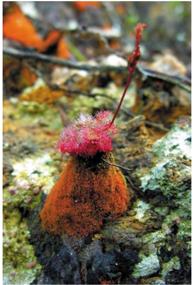
Fig. 2 Drosera spatulata on Mt Halcon, Mindoro.

Drosera spatulata : PHILIPPINES, Luzon, Cuming 857 (L, M); Luzon, Albay Province, Mayon Volcano, road cut, open slope, 1015 m, flowers white, 04.06.1953, D.R. Mendoza 18321 (L); Mindoro, Mt Halcon, in open heaths,