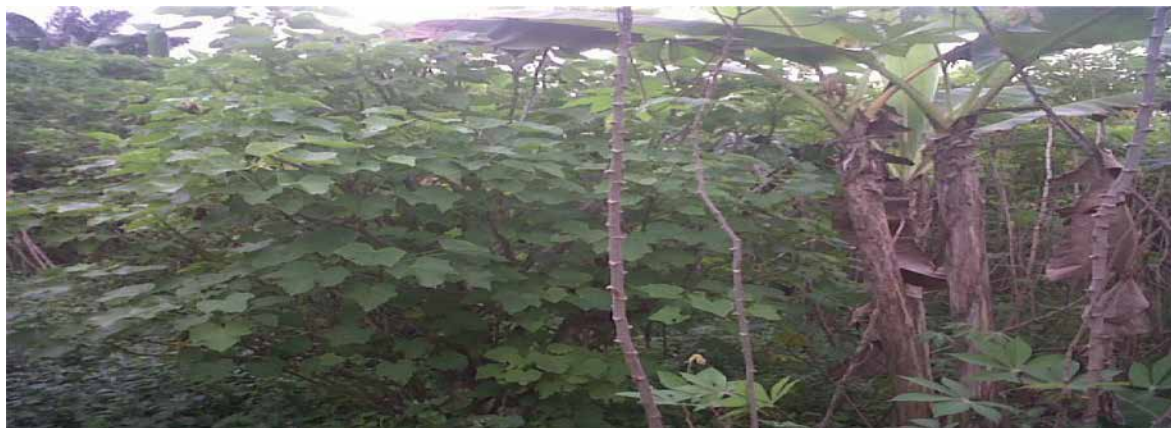
FIGURE 6 Jatropha intercropped with cassava and plantain, Eku, Delta State, Nigeria

was intercropped with cassava (Figure 6). Massive land areas are still available for production in the country. Over 4 000 ha of land has been projected for Jatropha in Nigeria.