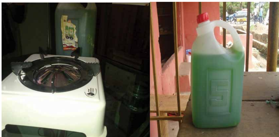
FIGURE 7 Biofuel cooking stove in Ibadan(left) and the extracted bio-crude(right) in Makurdi, Nigeria

and Canrex Biofuel Limited) are engaged in the refining of biodiesel for final consumption by GSM providers. The larger proportion of feedstock for biodiesel production in Nigeria comes from Jatropha curcas nut oil. It was estimated that a hectare of Jatropha plantation is able to yield between 0.5 and 12 tonnes of nuts per annum depending on the age of the plantation and management practices adopted, and if the right inputs such as booster fertilizers and hybrid seeds for plantation establishment are used. In addition, one metric tonne of Jatropha nuts yields up to 139 litres of crude biodiesel. On the average, 100 kg of Jatropha curcas nuts are produced per hectare in a year. Estimated yields of raw materials used in biofuels production as reported by the Nigerian National Petroleum Corporation (NNPC 2012) are given in Table 10. Current consumption of biodiesel in the study area is around five litres per month per household. Also, according to FAO et al. (2011) there are several emerging bioethanol projects in Nigeria based on sugar cane and cassava plantations. The